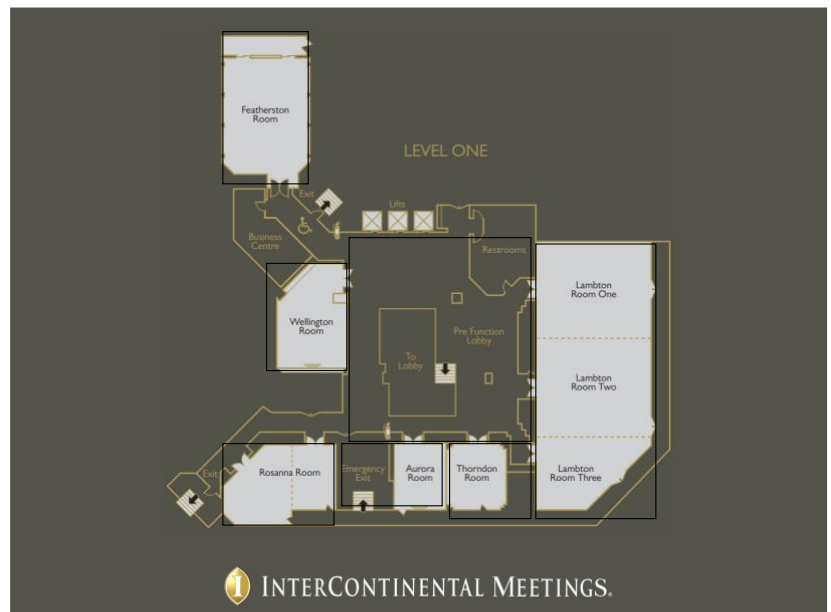
ETF2019 Trade display layout: Pre-Function Lobby

To inquire about sponsorship opportunities contact: Peter Burley info@eventingthefuture.co.nz 021 194 0104